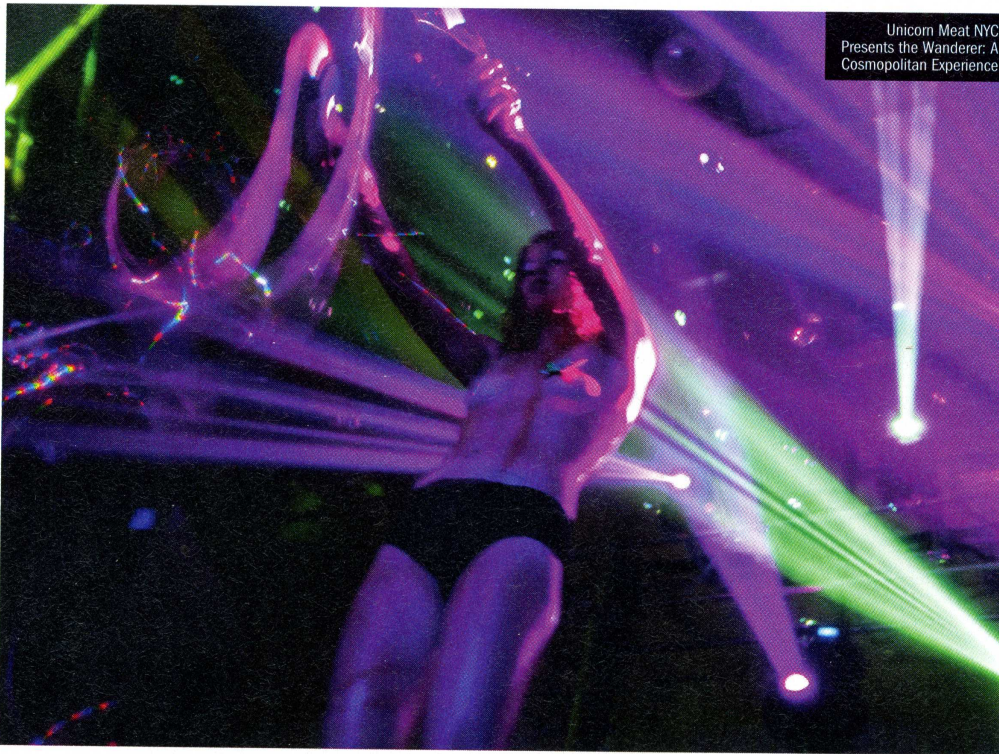
Unicorn Meat NYC Presents the Wanderer: A Cosmopolitan Experience

remember: It's not quality but wild energy that makes this party. Union Hall , 702 Union St between Fifth and Sixth Aves, Park Slope, Brooklyn (718-638-4400, unionhallnyc.com). 8pm; $5.